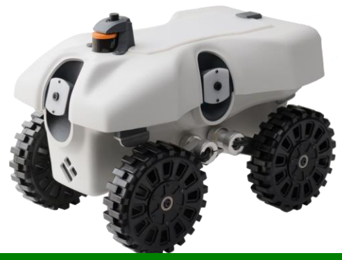
Robotics - Potential Future for Mechanical Weed Control