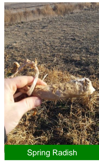
Seven Species Cover Crop Mix, Manning IA